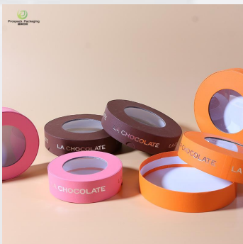
paper tube with window