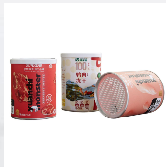
Easy peel off lid paper tube