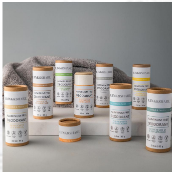
Lip balm/deodorant push up paper tube