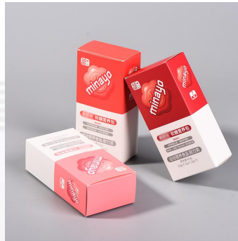
Paper Card box