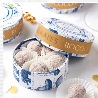
Food paper tube with flat edge