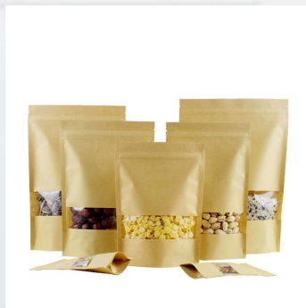
Food paper bag