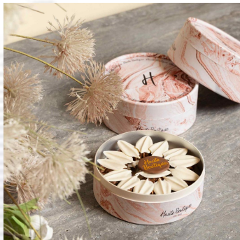
Food paper tube with roll edge