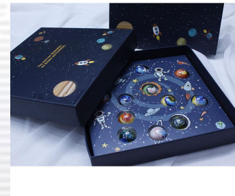
Top & Bottom paper box