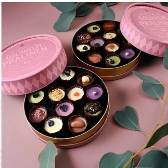
Food paper tube with roll edge