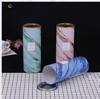
paper tube with iron lid