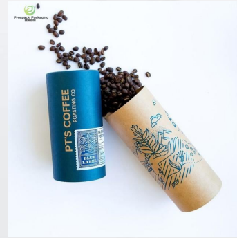
Sleeve paper tube