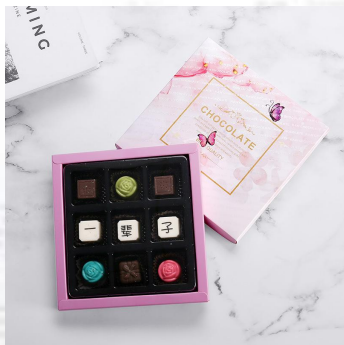
Top & Bottom paper box