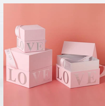
Top & Bottom paper box