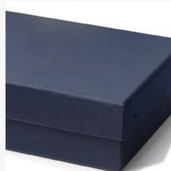
Soft Touch Laminate