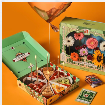
Corrugated paper box