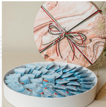
Food paper tube with flat edge