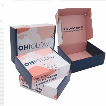
Corrugated paper box