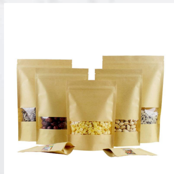
Standing paper bag