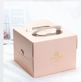
Paper card box